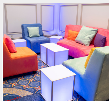
Furniture & Decor